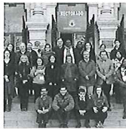
University of Cordoba

Spanish version IUCN National Committee in Spain